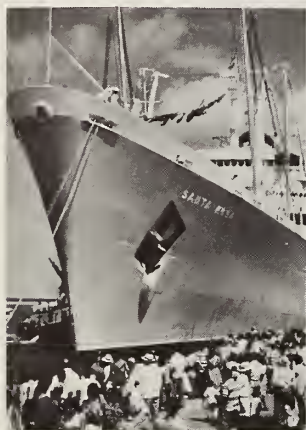
Tourists — here docking at Aruba — are largely responsible for the southern Caribbean's growing market for food and agricultural products. Article starting on opposite page covers the potential for U. S. farm exports to the area.